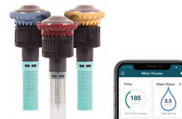
RAINBIRD HIGH EFFICIENCY ROTARY NOZZLES