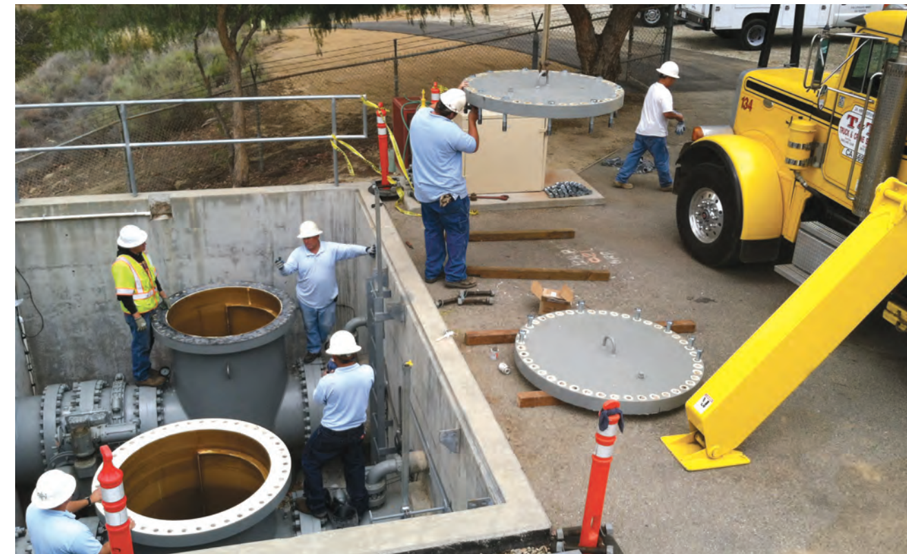
Above: Calleguas crews work to remove the protective inlet screens at the East Portal hydroelectric facility. Water supply conditions require the removal of these screens to keep the hydroelectric generator in service during periods of drought. Right: Archive images that show construction of the Calleguas water distribution system.