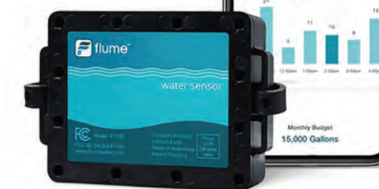
FLUME SMART WATER METER MONITOR