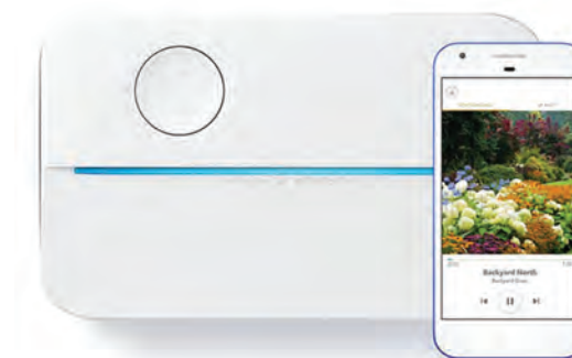
RACHIO SMART IRRIGATION CONTROLLER

It is a partnership between the District and its customers that will make the water system serving the Malibu and Topanga communities more resilient to climate change. The District has implemented measures to provide reliable control of the system. The District will construct new projects to improve the delivery of water to customers. We request your help in reducing the amount of water that must be imported to the area. Together we can improve the area's water resiliency. ○