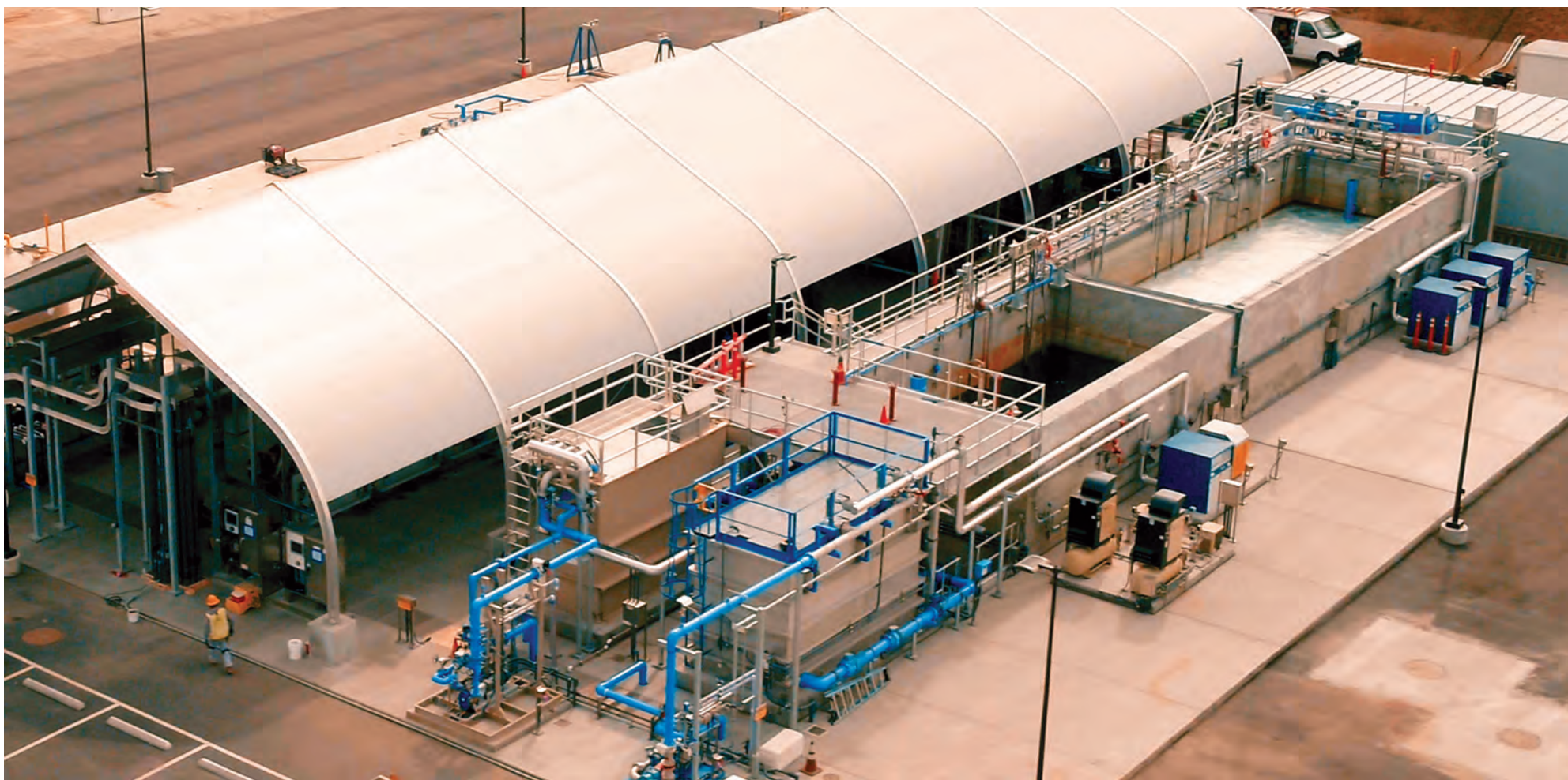
Located in Carson, this demonstration facility purifies 500,000 gallons of treated wastewater per day by using membrane bioreactors, reverse osmosis and ultraviolet light to remove bacteria, minerals and other chemicals. A full-scale facility would make the region less dependent on imported water.