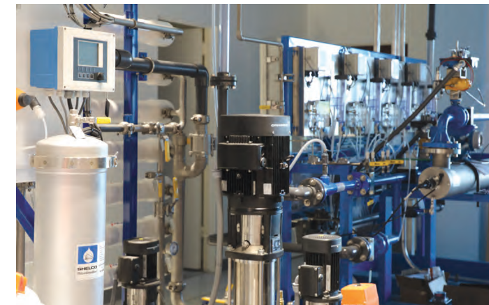
Pure Water Technology like microfiltration/ultrafiltration, reverse osmosis, and ultraviolet light/advanced oxidation are used to further treat recycled water to above drinking water standards. By the end of the decade, our region will receive 15% of its water supply from indirect potable reuse.

The PWDF and sustainability garden are just a couple ways LVMWD is pushing the envelope to practice and encourage efficient water use. When considering how to improve your own water savings, start with your outdoor watering. LVMWD offers assistance and resources - such as discounted weather-based irrigation controllers - to help you save water and money.