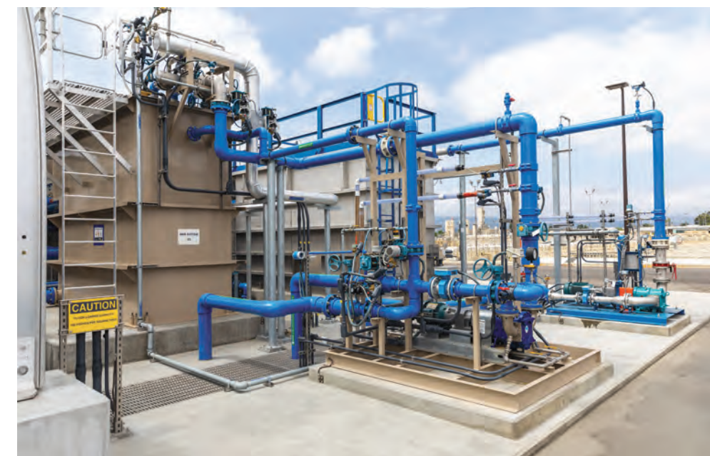
The new demonstration facility, above, uses a three-step process to purify treated wastewater into purified water. Data from this plant will be used to meet regulatory requirements for a full-scale facility that could eventually provide water to half a million homes. At top, the Los Angeles County Sanitation Districts Joint Water Pollution Control Plant in Carson.

The full-scale program could produce up to 150 million gallons per day of purified water, which is equivalent to the water needs of half a million homes. The program is estimated to cost $3.4 billion to build and $129 million annually to operate, resulting in a water cost of about $1,800 per acre-foot. (An acre-foot of water is enough for three California households.) Purified water would be delivered through up to 60 miles of new pipelines to potentially four groundwater basins in Los Angeles and Orange counties, industrial facilities and possibly two MWD treatment plants. These groundwater basins supply water to 7.2 million people.